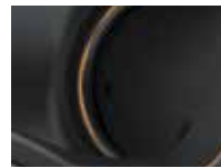
716 - Aged Bronze

Not all levers are available in all finishes.