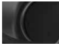
622 - Matte Black