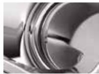
625 - Bright Chrome