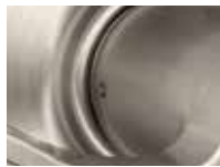
619 - Satin Nickel