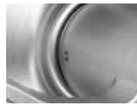
626 - Satin Chrome