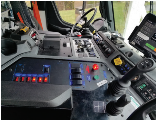
SIMPLE, EASY-TO-USE INTEGRATED CONTROLS