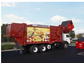
TAILGATE CNG UP TO 120 DGE