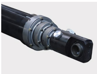
GLADIATOR PACK-EJECT CYLINDERS