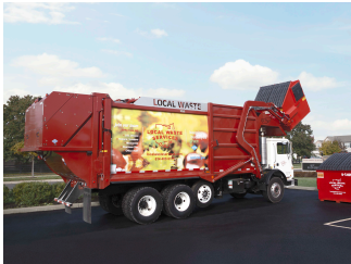
TAILGATE CNG SYSTEMS 70-120 DGE