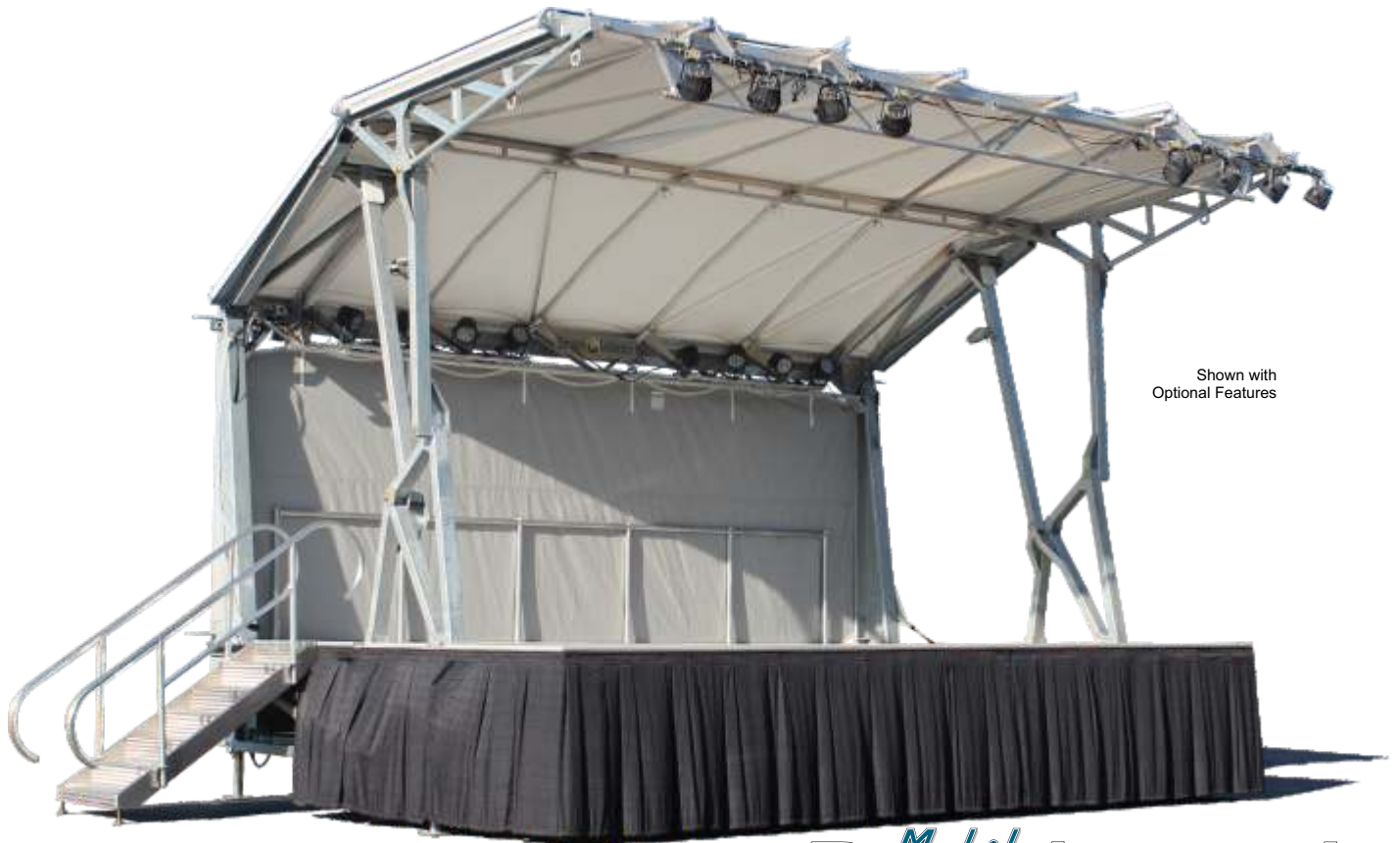
Shown with Optional Features