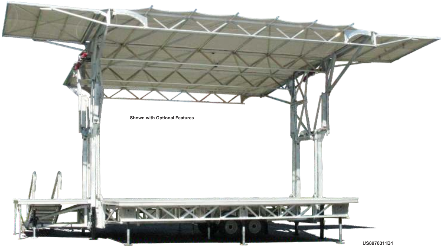
Shown with Optional Features