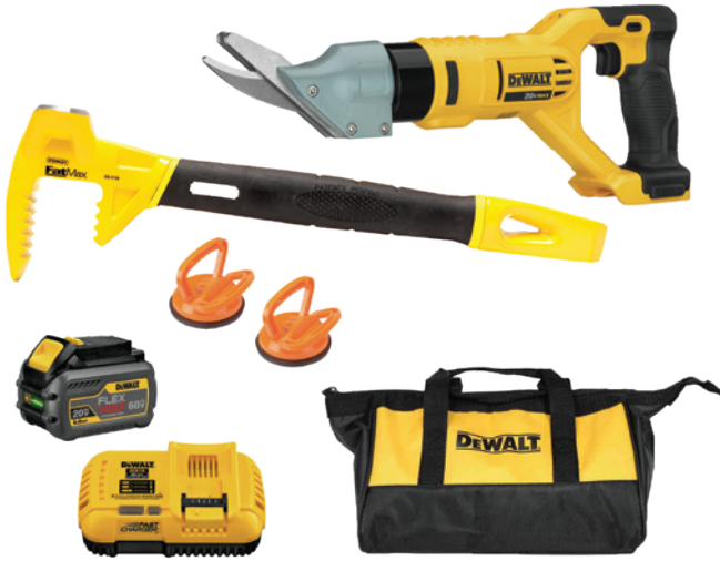
WINDSHIELD REMOVAL KIT | WNDREM-KIT