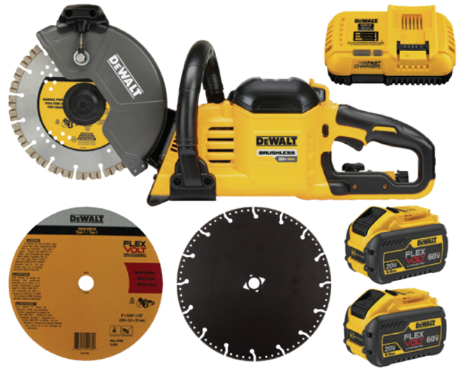
CUTOFF SAW KIT | CUTSAW2-KIT